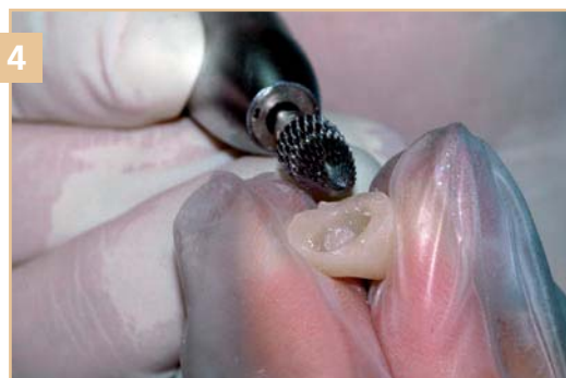
Finishing of the temporary crowns and bridges in ACRYTEMP