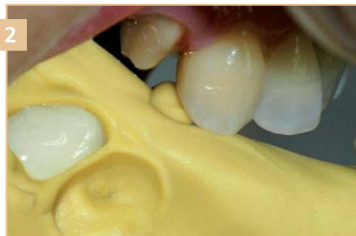
Repositioning of the impression on the preparation