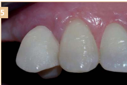
5 Temporary crowns and bridges