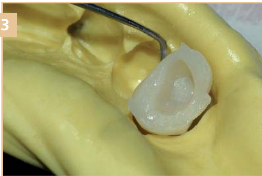
3 Removal of the temporary crowns and bridges from the impression after setting