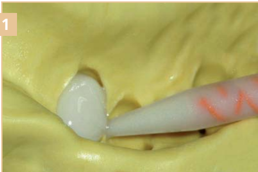
1 Application of ACRYTEMP inside the impression taken before working on the preparation